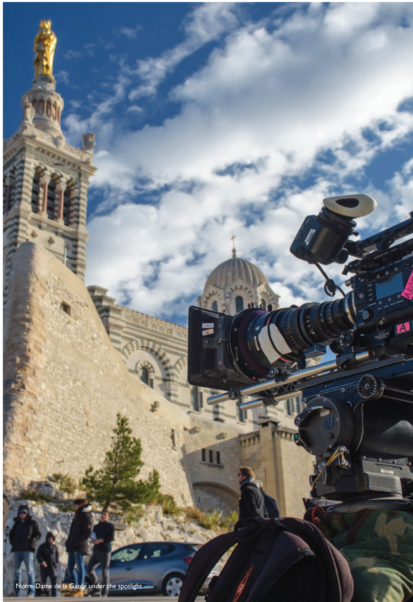
Notre-Dame de la Garde under the spotlight