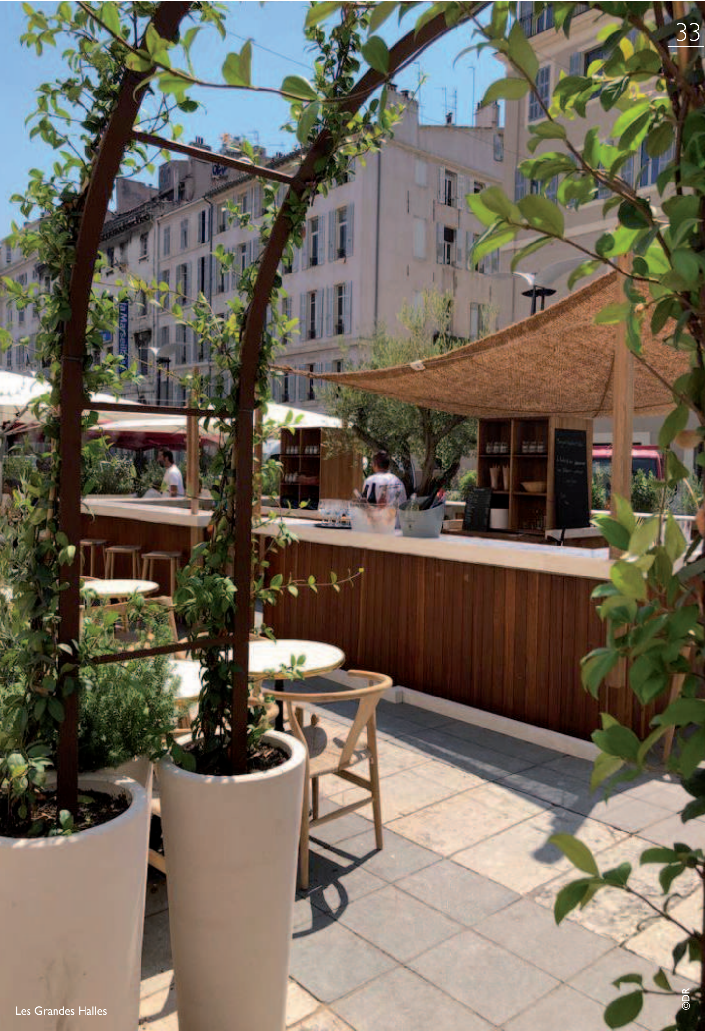
Les Grandes Halles